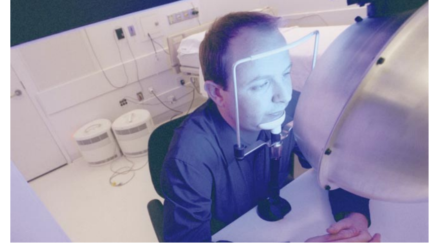
Out of the blue: doses of light therapy could boost production of hormones that set the body clock.

Shift work is the most notorious example. Night-shift workers do not adjust their circadian rhythms because they are exposed